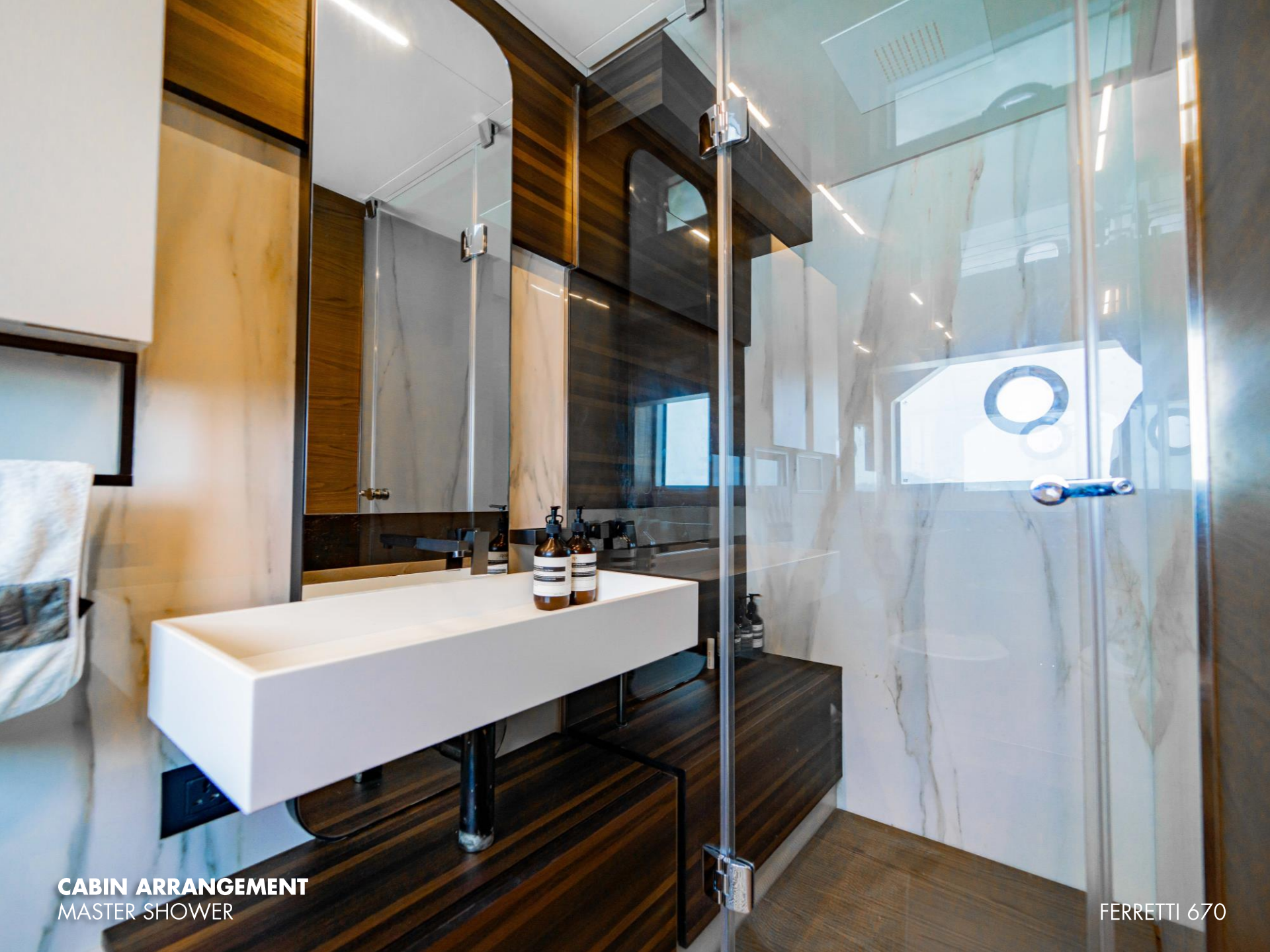
CABIN ARRANGEMENT MASTER SHOWER