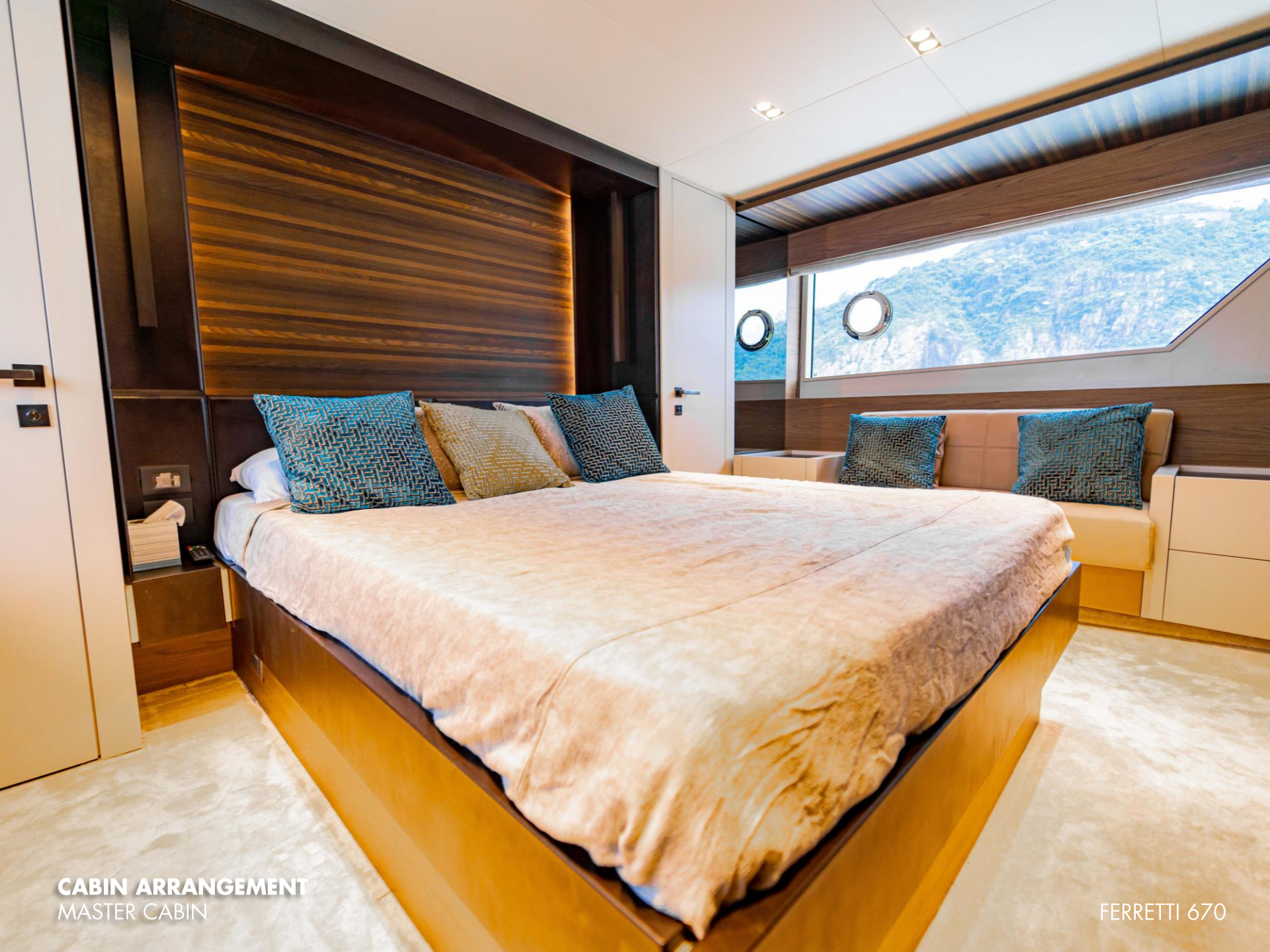
CABIN ARRANGEMENT MASTER CABIN