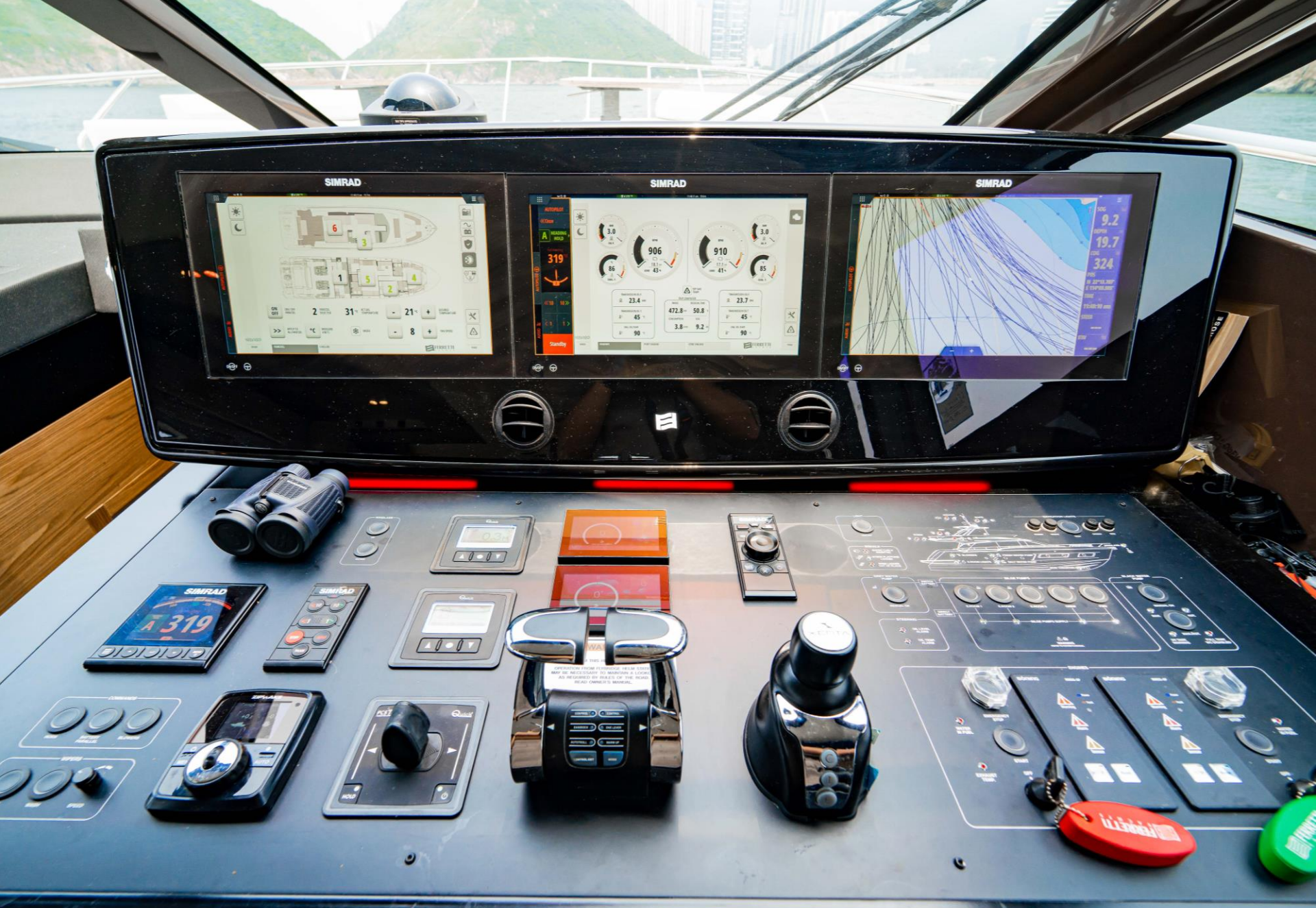
TECHNICAL AREAS MAIN HELM