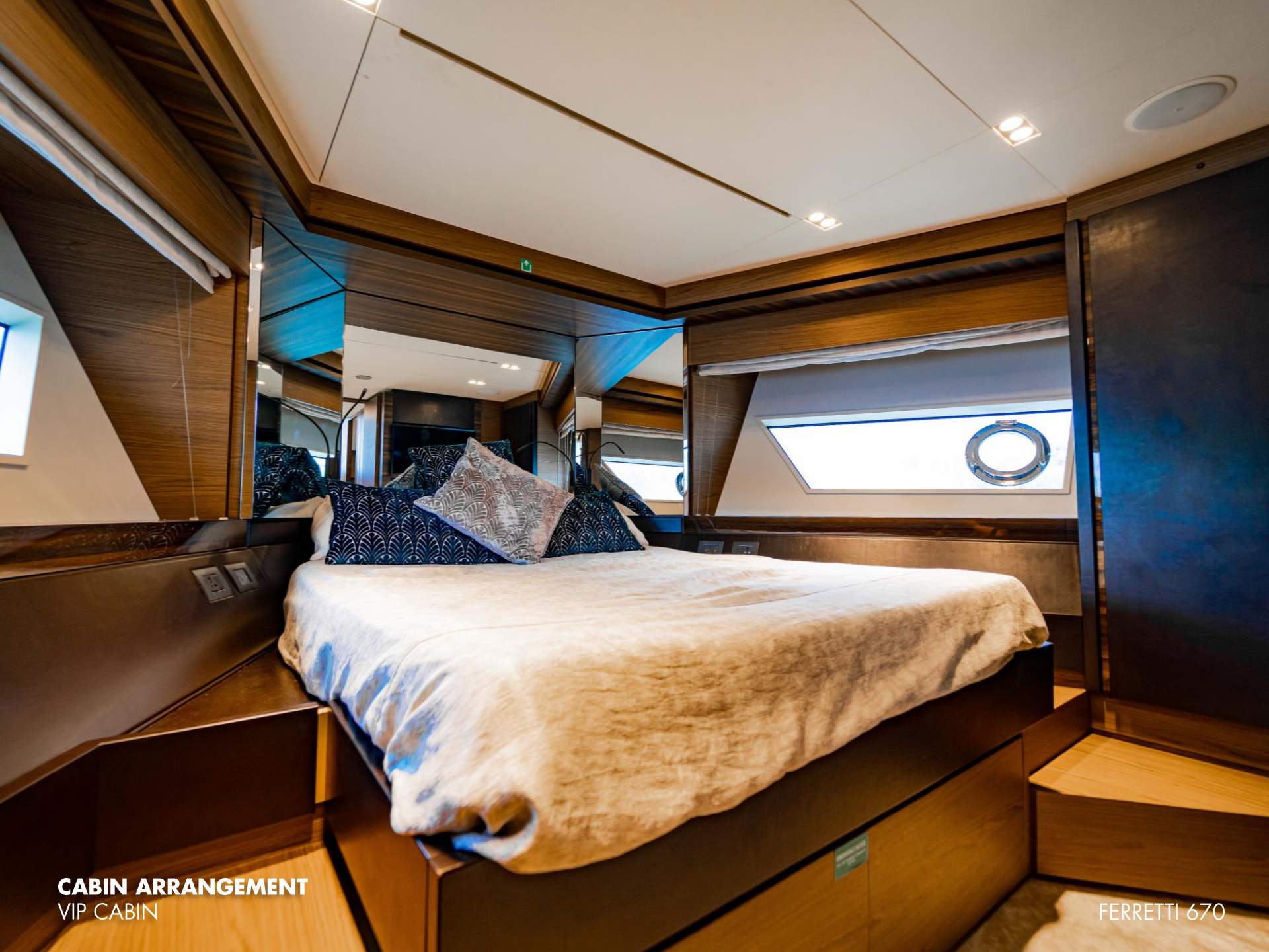
CABIN ARRANGEMENT VIP CABIN