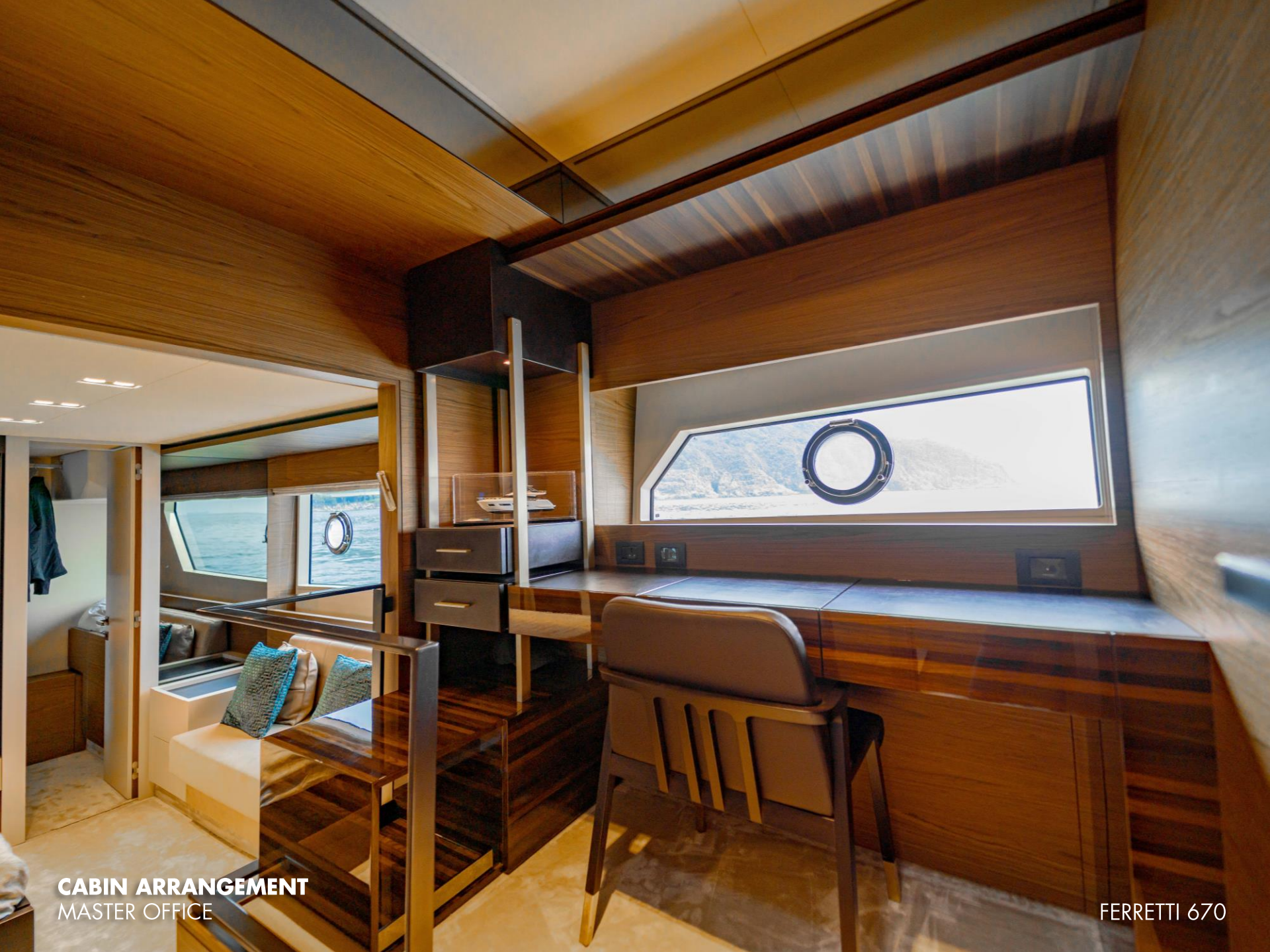
CABIN ARRANGEMENT MASTER OFFICE