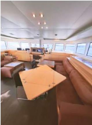
Expandable Banquette Tables