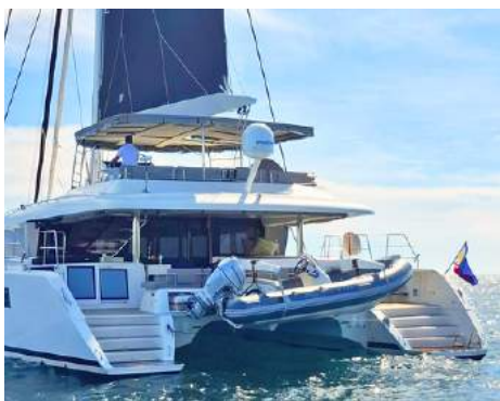
Transom Steps & Dinghy