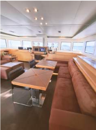
Expandable Banquette Tables