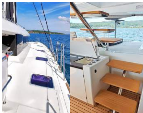
Deck & Deck Stairs