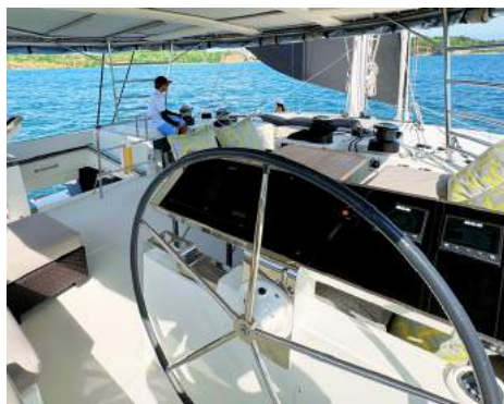
Wheel Helm Station